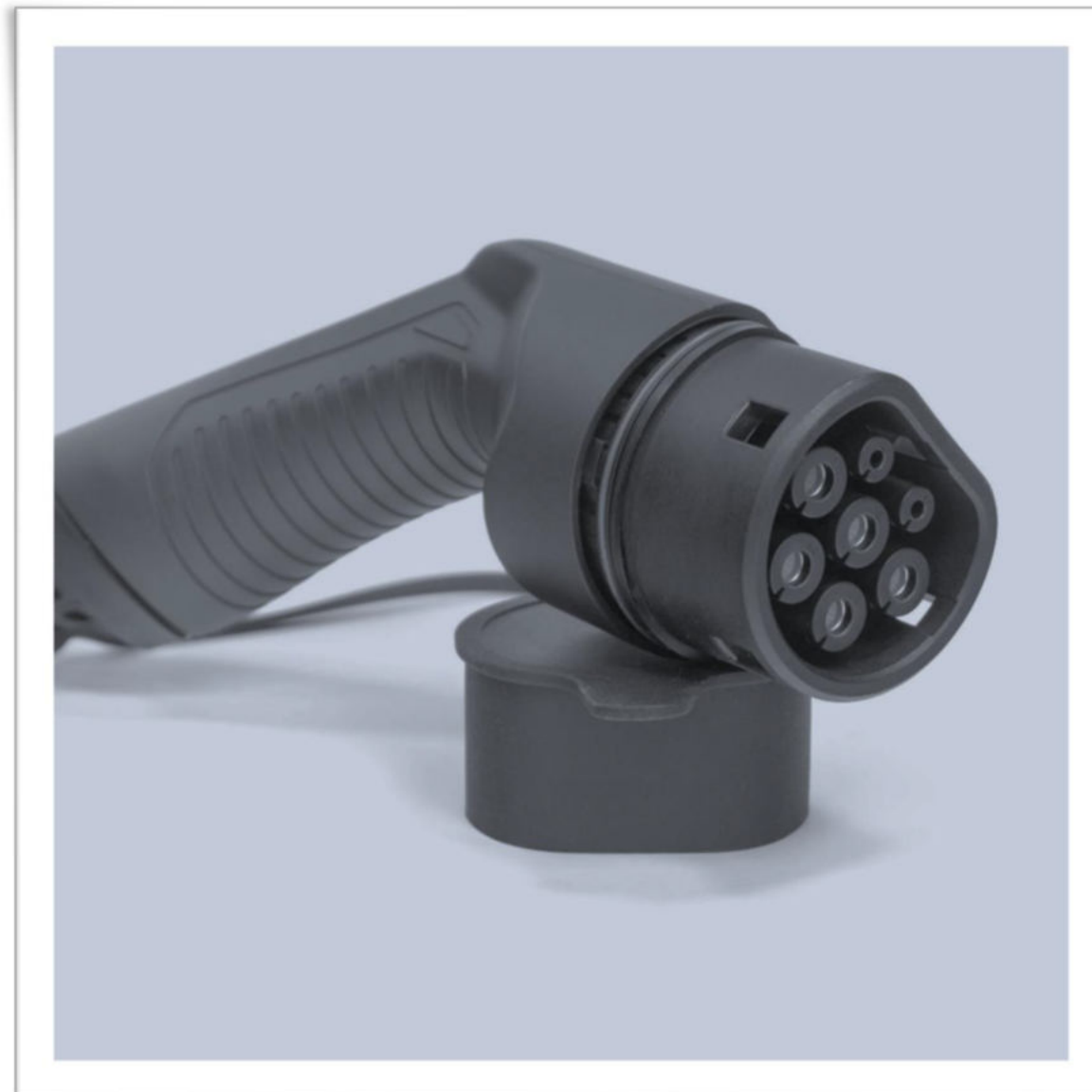
Type 2 Charging Plug